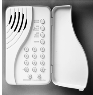
Model No. 60-924-3

The wall-mounted wireless Dialog Touchtalk 2-Way RF Touchpad combines a conventional ITI Learn Mode™ touchpad with an RF receiver, speech chip, and voice amplification circuit for your Simon 3™ (version 3.3 and later) security system.