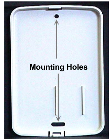
Figure 2. Touchpad Mounting Plate